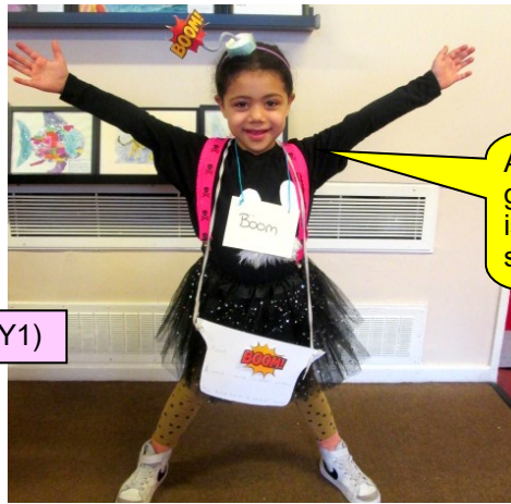
Boom! (Reva Y1)

A base drum goes, boom! It is a loud sound.