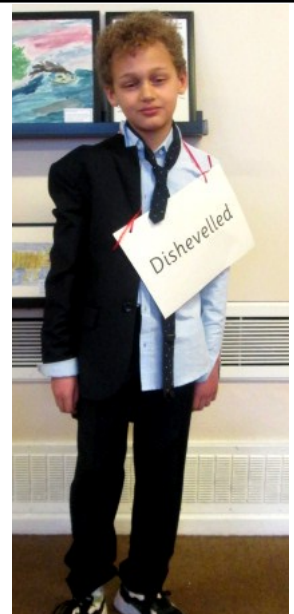
Dishevelled (Edouard Y5)

A base drum goes, boom! It is a loud sound.