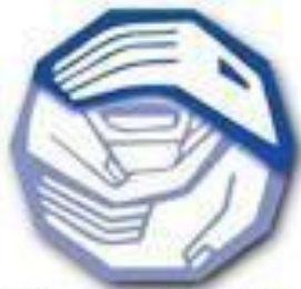
The hand of Christ blesses the cup