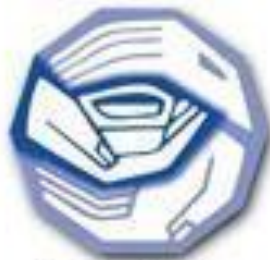
The hand of love offers the cup