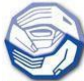
The hand of suffering receives the cup