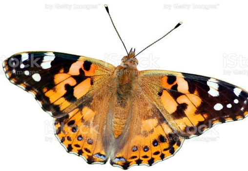
Painted Lady Butterfly

Our beautiful butterflies finished hatching over the weekend! When we got back to school on Monday, they were ready to fly. We enjoyed watching them fly away on their new adventure :) We have been learning about all about the butterfly life cycle. Ask your child to tell you what happens in the life cycle.