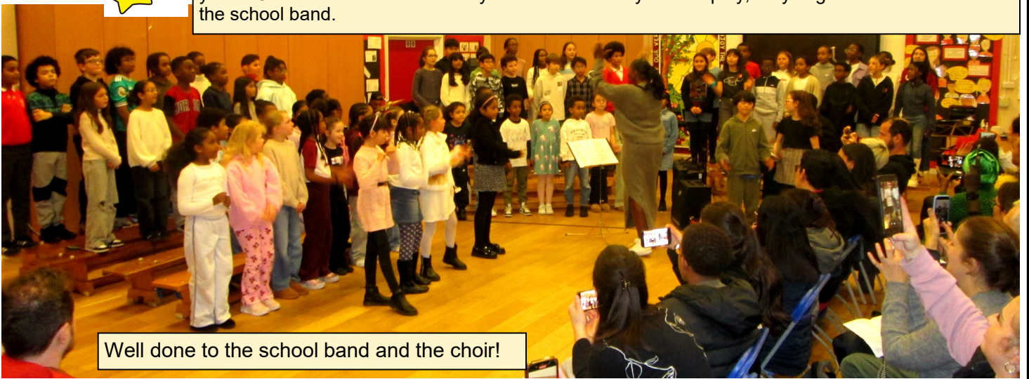
Well done to the school band and the choir!

If you would like your child to learn an instrument, please speak to the school office who will direct you to Camden Music Service. If your child is already able to play, they might like to audition for the school band.