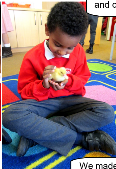
The ducklings are soft, fluffy and cute. I like stroking them.