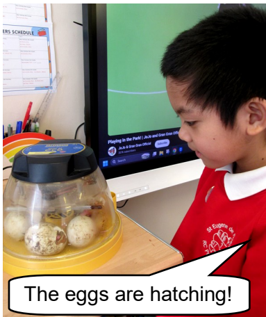
The eggs are hatching!

Year 2 are looking after some ducklings this week and next. The children watched the eggs hatch in the incubator. This is part of their science curriculum; learning about life cycles. We will put the ducklings into indoor club every afternoon. Do pop in and see them if you'd like to. Springtime and this lovely new life is a reminder of how wonderful God's world is.