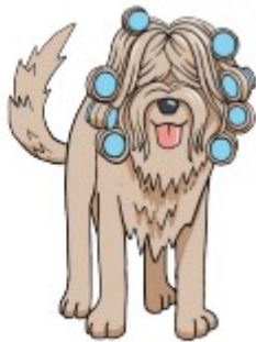
curl the fur