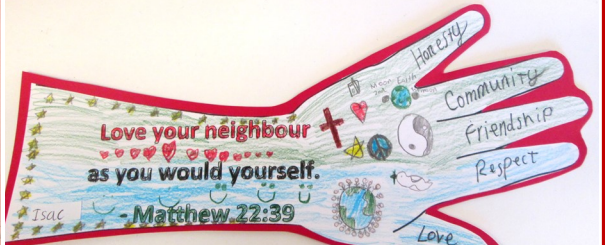
Isac Y2 (key messages from The Good Samaritan parable)