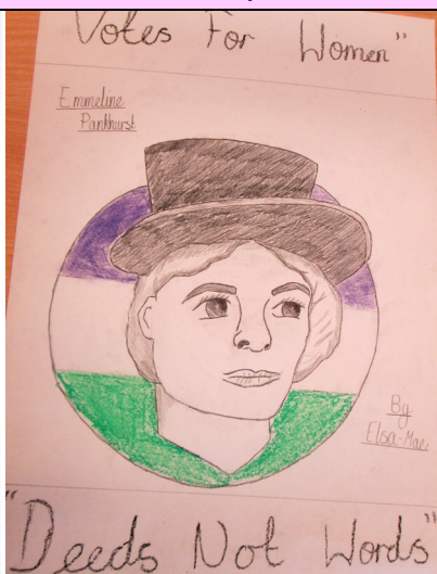
Emmeline Pankhurst by Elsa-Mae Y5