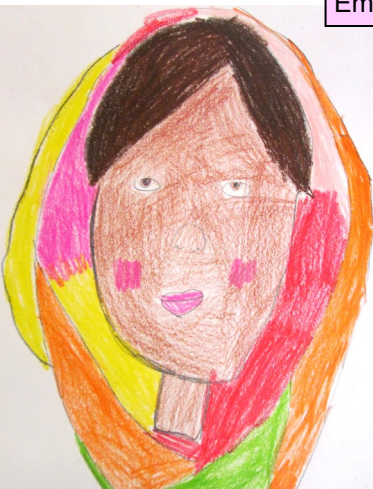
Malala by Maeve Y3