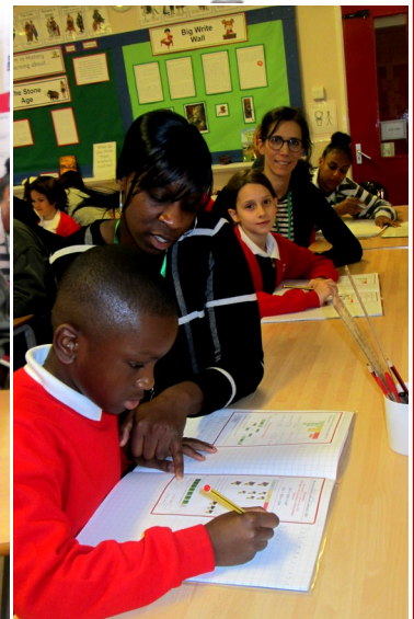
"Parents Working Alongside Children" Mathematics lesson in Year 3